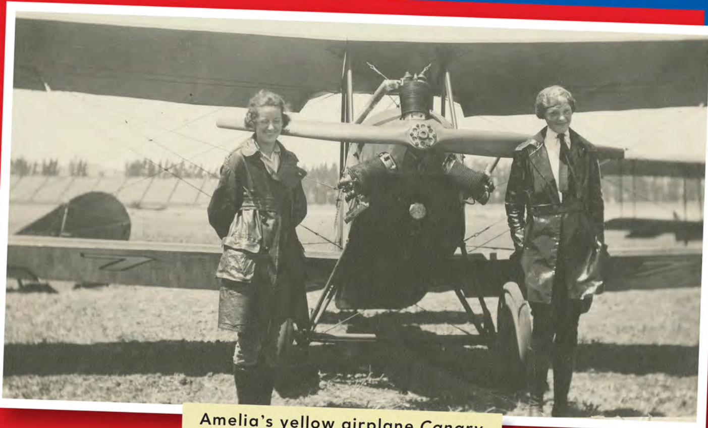
Amelia's yellow airplane Canary

People said Amelia was crazy for trying to fly. But she loved her flying lessons. She began saving her money. She had her eye on a little yellow airplane. It took six months of saving. Amelia bought the yellow airplane and called it Canary .