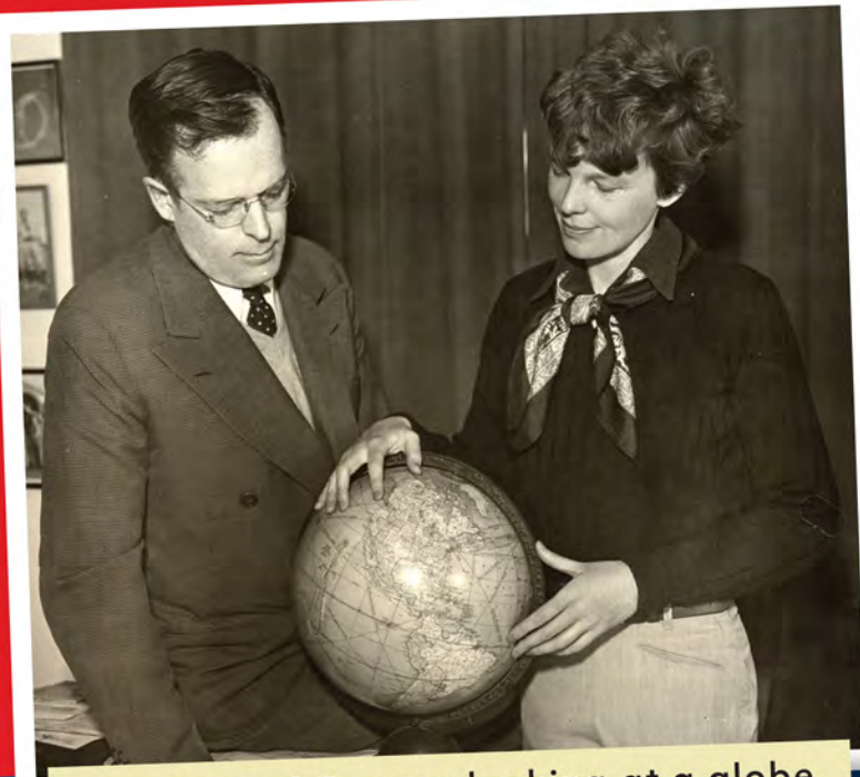
Amelia and George looking at a globe and planning her world flight

Amelia and George planned a solo trip for Amelia. She would fly alone across the Atlantic Ocean. No woman had ever flown that far before. Many people said a woman could not do it. But Amelia had her mind set that she could do it.