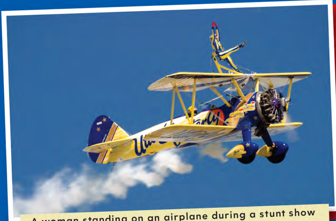
A woman standing on an airplane during a stunt show

One day Amelia and her friend went to a stunt show. Airplanes did tricks up in the sky. Amelia saw an airplane swoop out of the air and zoom near her. She said she heard the airplane calling to her. Soon she took flying lessons.