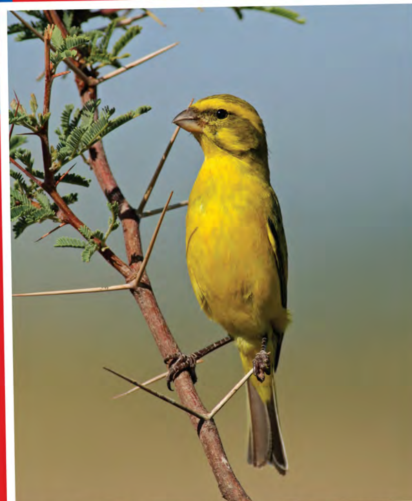
Amelia's airplane was yellow like a canary.

Amelia used Canary to set her first record. She flew 14,000 feet into the sky!