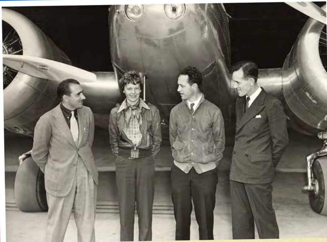
Amelia, Fred, and friends standing in front of her airplane

Amelia wanted to be the first woman to fly around the world. In 1937, she and her friend Fred Noonan began the trip. They made it almost all the way around the world. They had to land on an island to refuel the airplane.