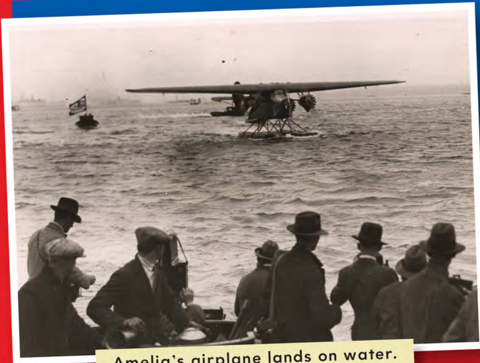
Amelia's airplane lands on water.

Amelia was the first woman to fly to faraway places all by herself.