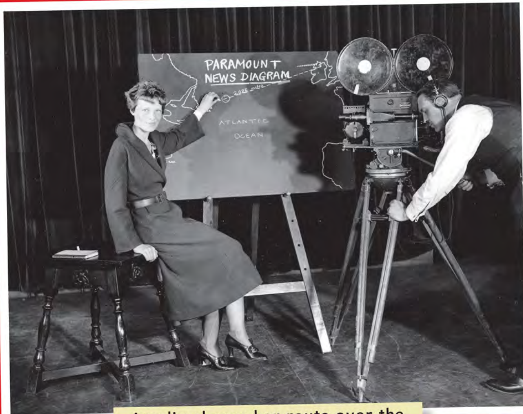
Amelia shares her route over the Atlantic Ocean with the news.

In May 1932, Amelia began her solo flight. She was headed for Paris. But strong winds made it hard to fly. Amelia had to land sooner than she planned. She landed on a farm in Ireland. She had made it across the Atlantic Ocean alone!