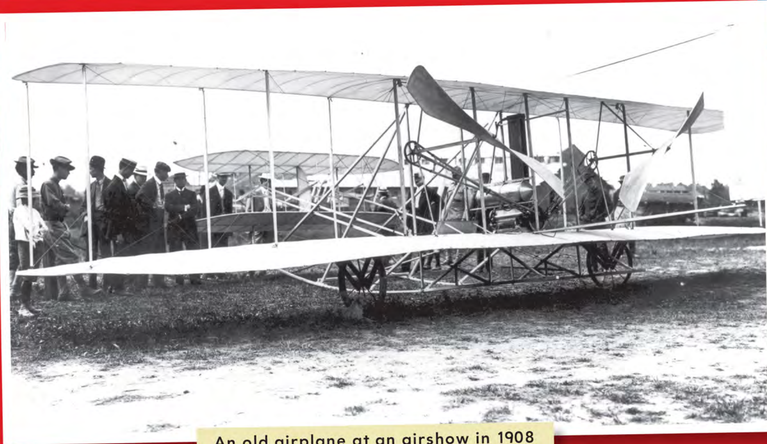
An old airplane at an airshow in 1908

Amelia saw her first airplane when she was 10. She did not like it. She thought it was loud and ugly. She was more interested in science. At school, Amelia loved her science classes best.