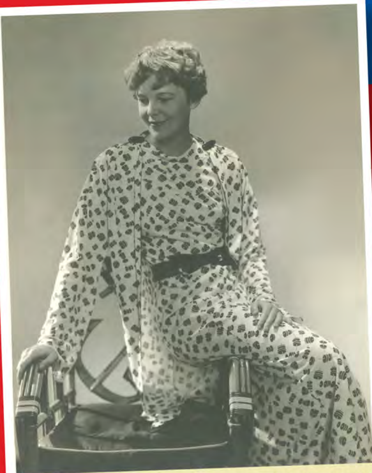
Amelia in one of the dresses she designed

A man named George Putnam had helped plan Amelia's flight across the Atlantic. Soon after, George and Amelia fell in love. But Amelia did not want to get married. She thought that meant she had to quit flying. George said she should keep doing what she loved. The couple married on February 7, 1931.