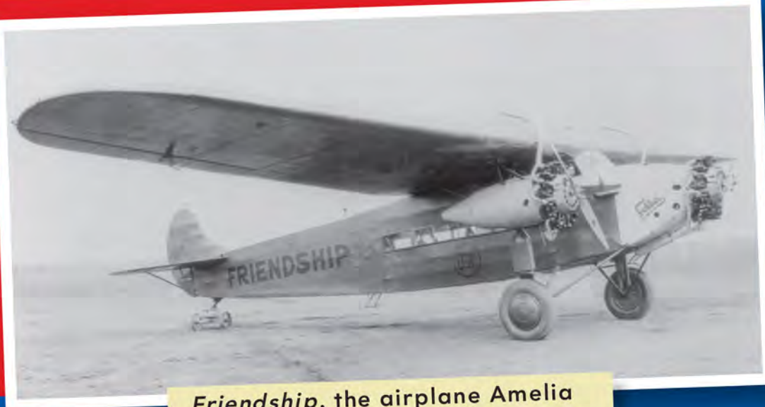
Friendship , the airplane Amelia flew in across the Atlantic Ocean

People heard about Amelia's love of flying. One day a man asked if she wanted to be the first woman to fly across the Atlantic Ocean. Of course she did! Amelia was excited to ride along. In 1928, she became the first woman to fly across the Atlantic Ocean as a passenger.